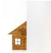
Stadip 33.1 PVB Mat