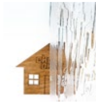
Niagara white matt