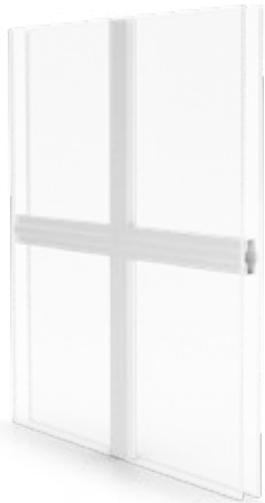
INNER GLASS MUNTIN