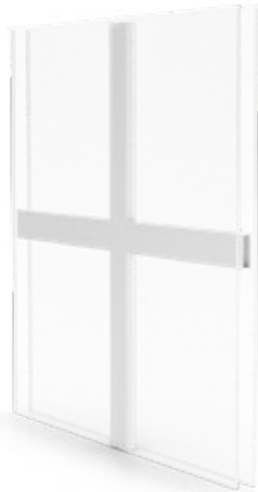
BLIND INTERNAL GLASS MUNTIN